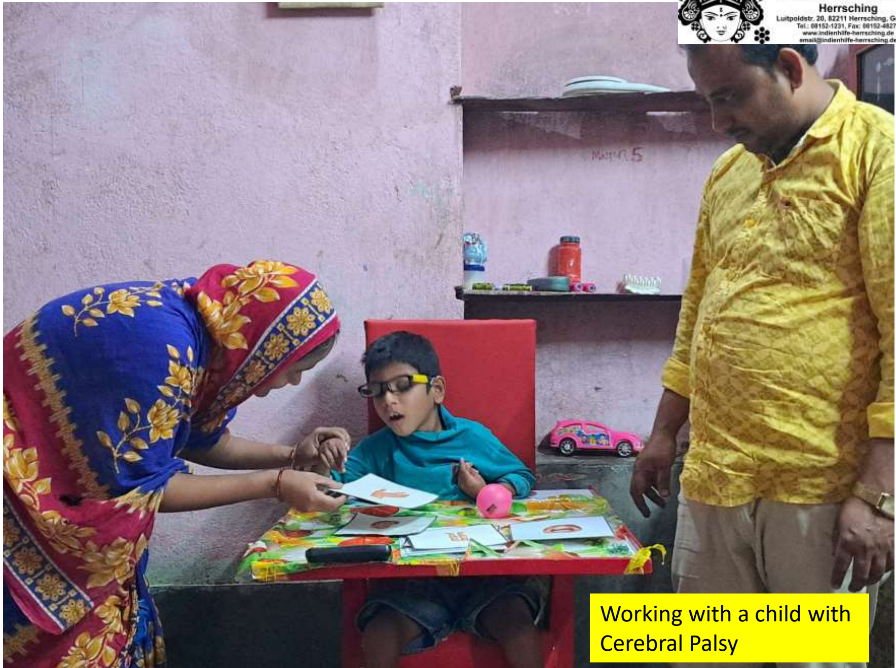
Working with a child with Cerebral Palsy