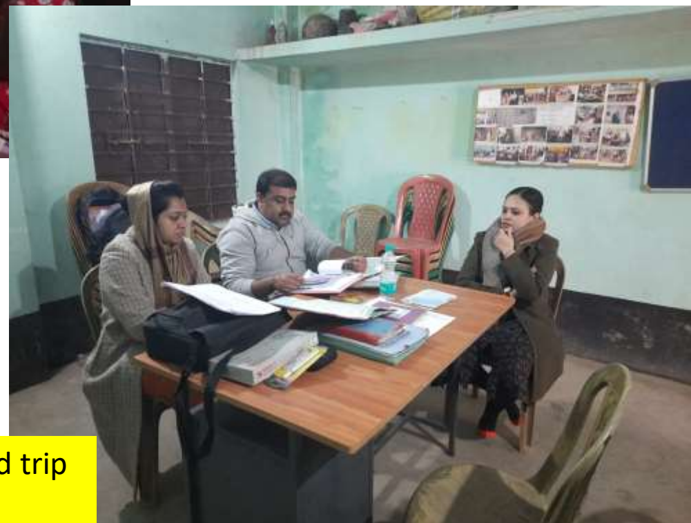
IH Consultants during their field trip to DMSC