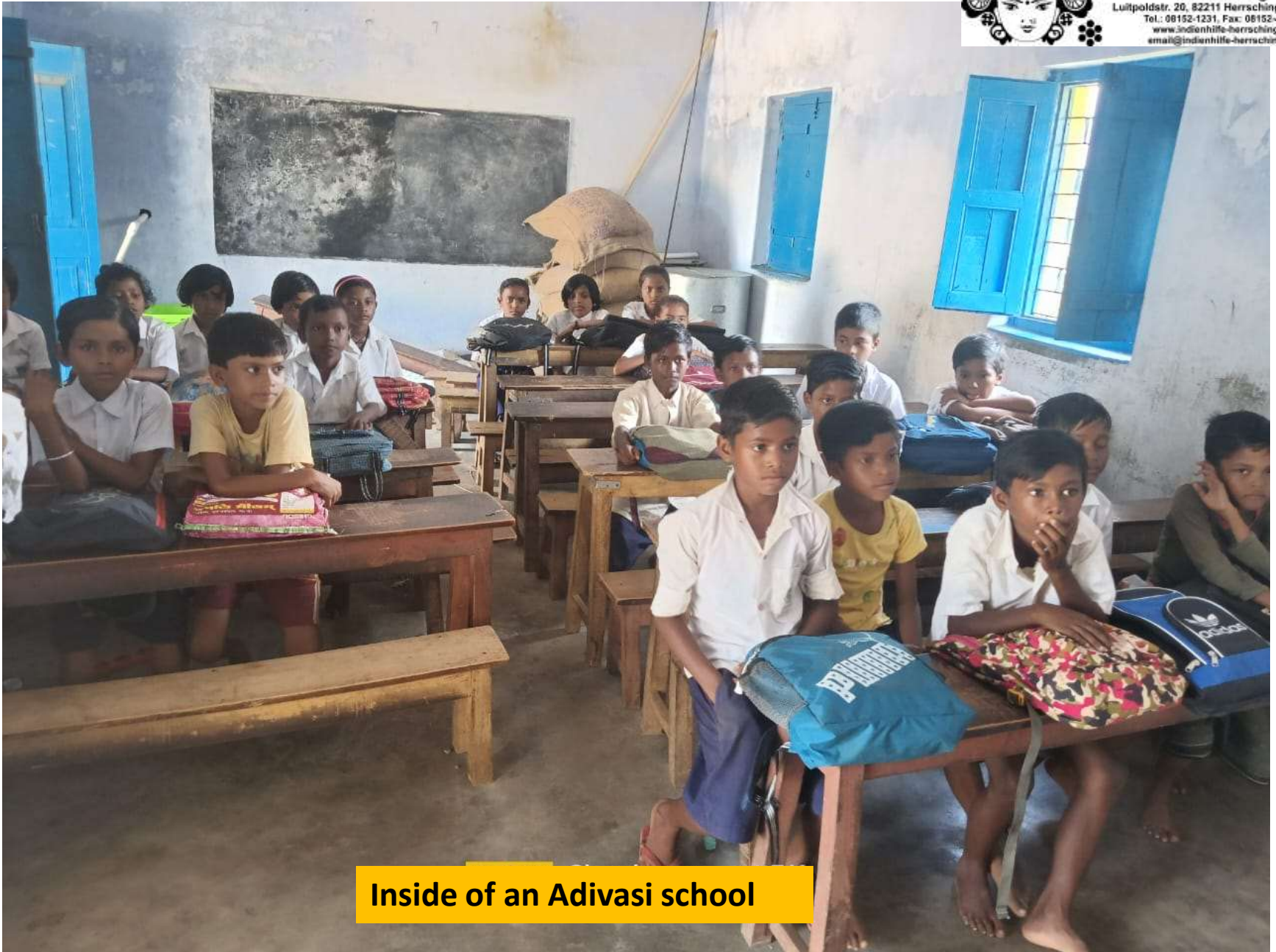
Inside of an Adivasi school