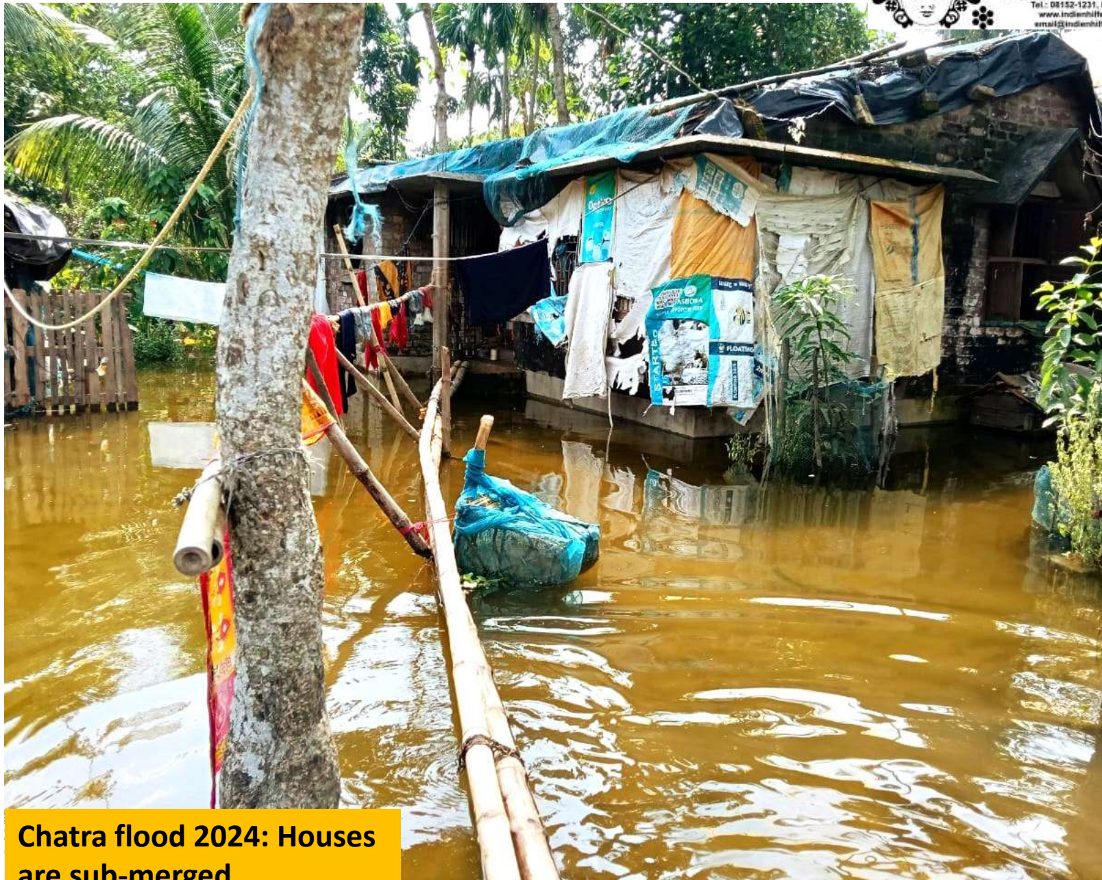
Chatra flood 2024: Houses are sub-merged