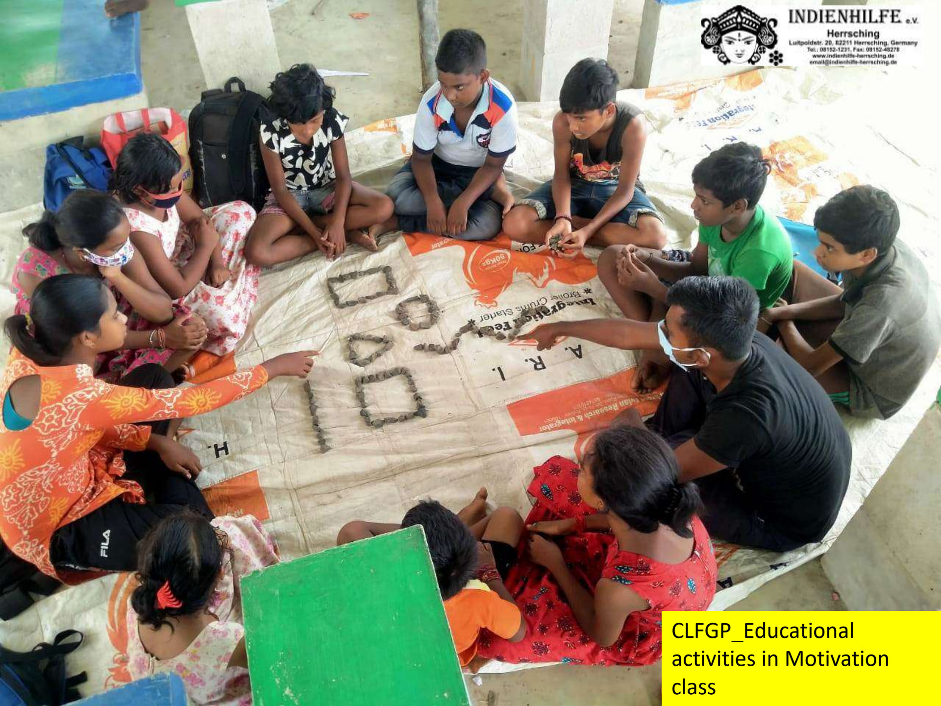
CLFGP_Educational activities in Motivation class