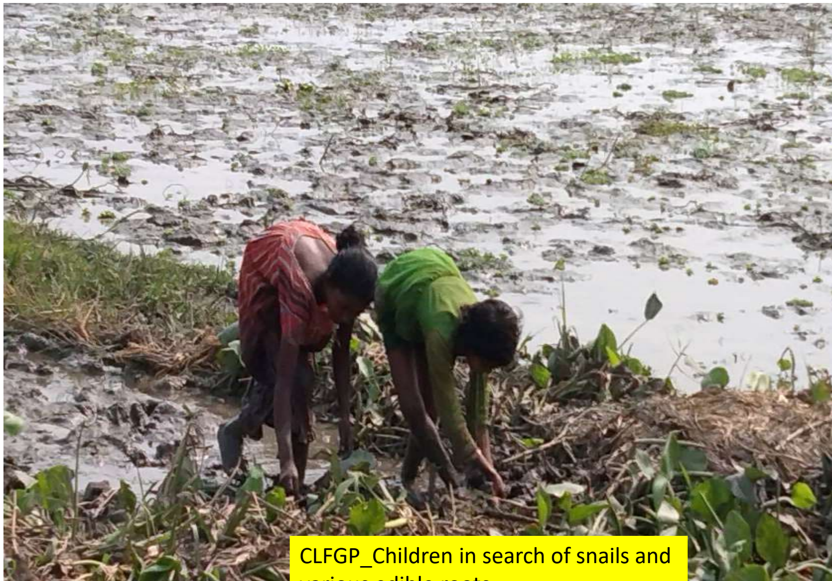
CLFGP_Children in search of snails and various edible roots.