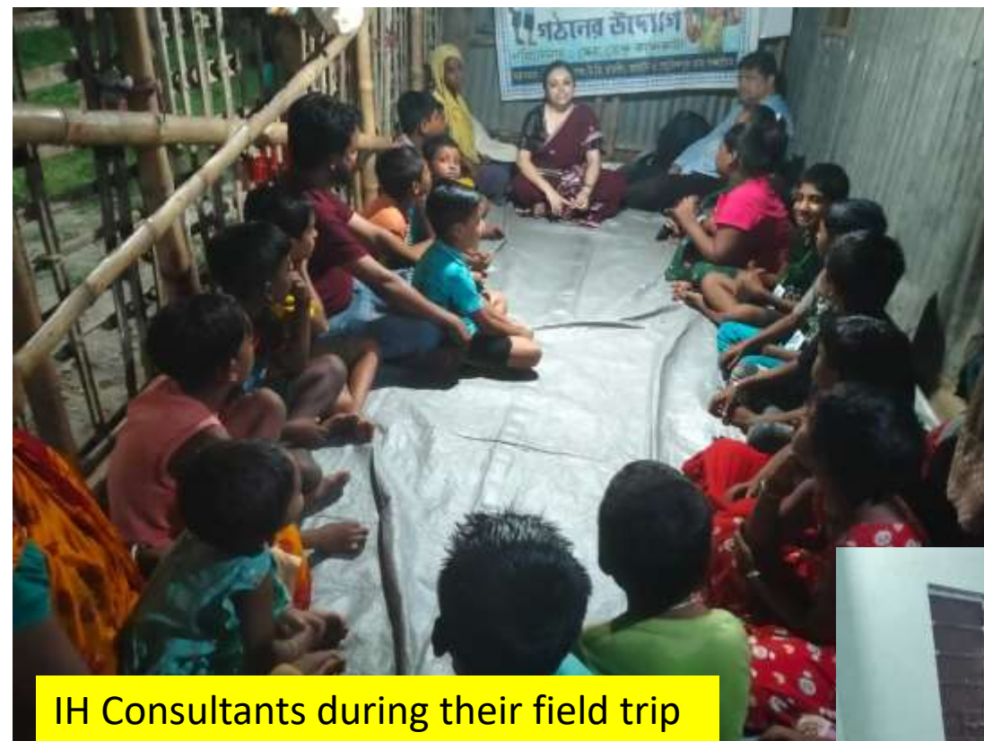
IH Consultants during their field trip to SKC